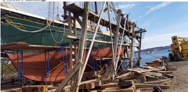
Shipyard in Rockland, Maine.

Lettie departed from Dobbins Landing on the evening of September 30th, heading once again for the Atlantic Ocean by way of the Welland Canal and the St. Lawrence Seaway. She stopped at North End Shipyard in Rockland, ME for the month of November before continuing down the East Coast. Lettie reached Florida just before the New Year, accumulating 2,520 nautical miles on her journey south.