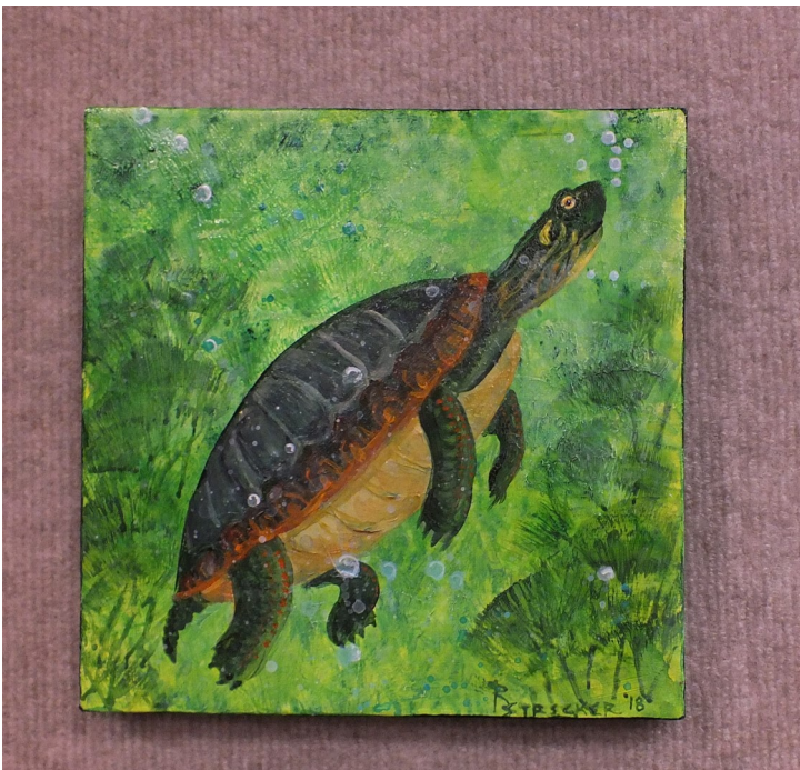
Ron Strecker's painting, Painted Turtle