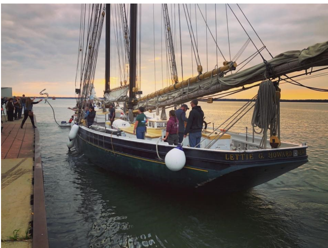
The last line is cast off for Lettie's departure from Erie at Dobbin's Landing.

The next week began a summer filled with day sails, Tall Ships Summer Camp, and port stops in Ashtabula, OH, Sandusky, OH, and joined the Niagara in Port Colbourne, ON for Canal Days. The schooner hosted over 5,000 passengers and 84 campers over the summer months, and nearly 400 Erie City 5th graders on school sails in the fall.