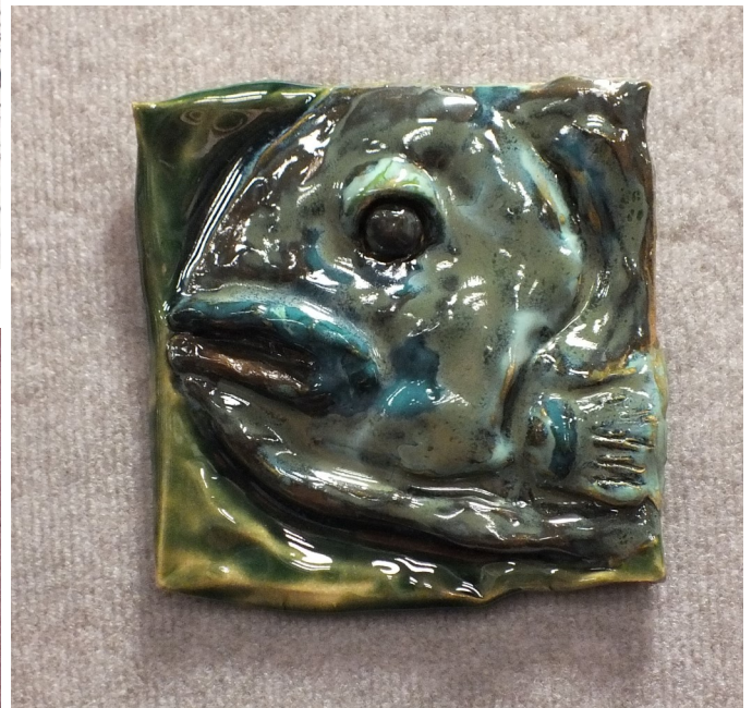
Emmalee Agostini's ceramic, Deep Lake Lurker